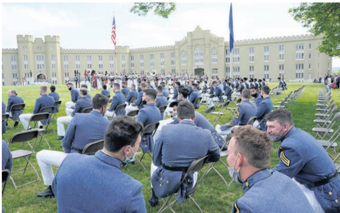
Virginia Military Institute class of 2021 watch during a change of command parade and ceremony on the parade grounds at the school in Lexington, Va., in this Friday, May 14, 2021, file photo.

acts and outcomes uncovered during this investigation are disturbing," the report states. "Although VMI has no explicitly racist or sexist policies that it enforces, the facts reflect an overall racist and sexist culture." The report notes that VMI has begun to make changes. But it also says that VMI "will likely follow through on its promised reforms only if it is forced to do so."